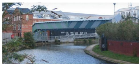
Arden has an extensive canal network that makes a link between the urban and rural areas of this NCA.