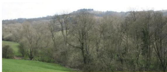
Looking towards Walton Hill, near Clent, the highest point in the NCA.

Source: Geological Narrative West Midlands Geodiversity Partnership