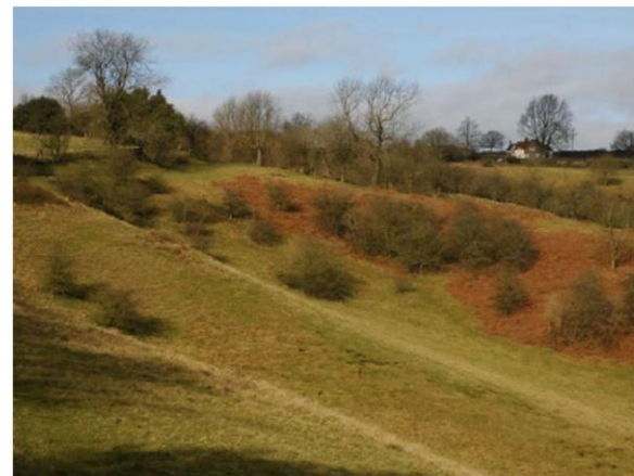
The eastern slopes of Walton Hill, the highest point in the NCA.

From the highest point in Arden (Walton Hill, in the Clent Hill range), there are views from the summit looking south-west into the Shropshire Hills, Malvern Hills, Teme Valley and south into the Cotswolds. There are also views across the NCA taking in the southern fringes of Birmingham from the Heart of England Way near Meriden.