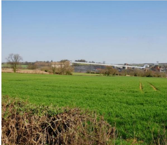
Over hedge and cornfield with Daw Mill Colliery in the background.