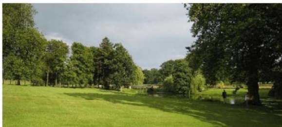
Many of Arden's parklands are studded with ancient oaks .

The heartland of the area is made up of a landscape of hedged, irregular fields and small woodlands. Narrow, often sunken lanes link scattered farms and there is a real sense of being closed in with restricted views. This contrasts with the more open views, gentle rolling pasture and regular, rectilinear fields around the southern edge of Birmingham. Deer parks were once common in the area and there is still an ancient wooded appearance to these sites. Veteran trees provide valuable habitats for invertebrates, noble chafer (green beetle) lichens and bats. Areas with a distinct parkland character can be found between Wroxall and Stoneleigh.