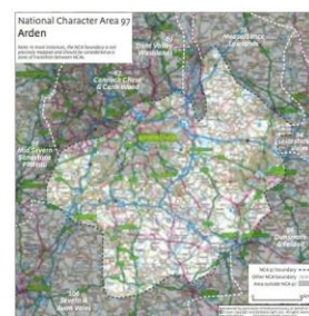
Click map to enlarge; click again to reduce.

■ SEO 2: Create new networks of woodlands, heaths and green infrastructure, linking urban areas like Birmingham and Coventry with the wider countryside to increase biodiversity, recreation and the potential for biomass and the regulation of climate.