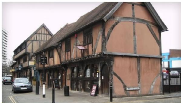
Many of the modern towns and cities in Arden still retain a historic core.

This is Shakespeare's 'Forest of Arden', historically a region of woodlands and heaths, which today remains one of the more wooded parts of the region. There