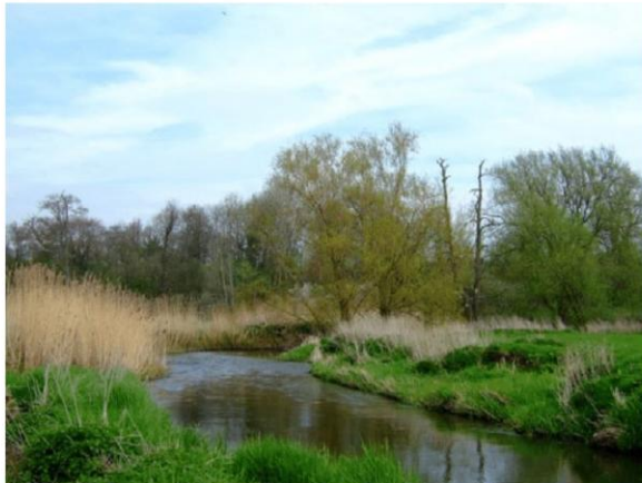
An example of the meandering clay river valleys with long river meadows typical of the Arden landscape.

Biodiversity and geodiversity are crucial in supporting the full range of ecosystem services provided by this landscape. Wildlife and geologically-rich landscapes are also of cultural value and are included in this section of the analysis. This analysis shows the projected impact of Statements of Environmental Opportunity on the value of nominated ecosystem services within this landscape.