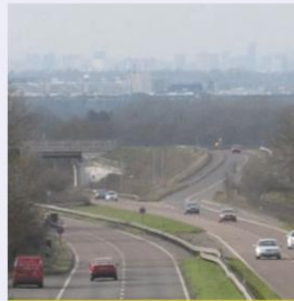
Demonstrating the undulating landscape between Coventry and Birmingham - looking west along A45, near to Meriden.