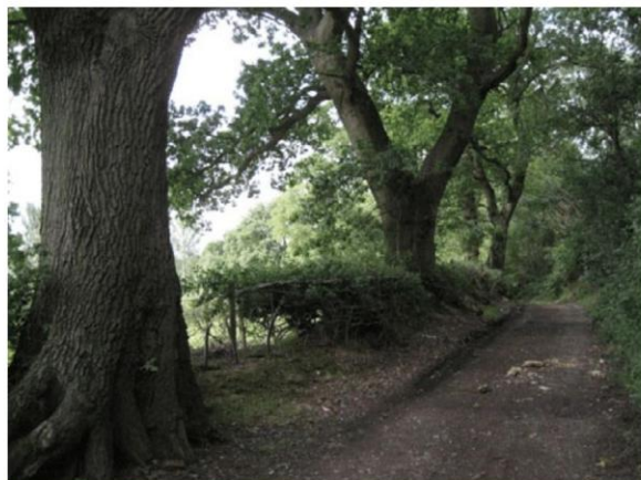
Frequent hedgerow oaks are a typical feature of the Arden landscape.