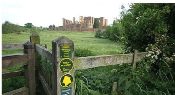
Kenilworth Castle, built using local stone.

Enclosure began in the south of the area in the 18th century. In the Blythe Valley, which traditionally had open fields, enclosure was not completed until the 19th century. Extensive tracts of planned enclosure can be found in areas that were until this time common or heath. It can also be found on the plateau summits where the heavy clay soils made cultivation difficult.